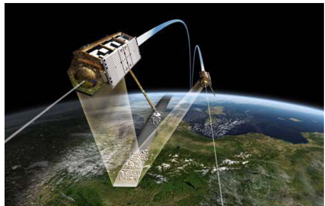
Fig. 1. — TanDEM-X artistic view. With across-track baseline values ranging from 120 to 500 m interferometric radar data for generating a high-resolution global Digital Elevation Model (DEM) has been acquired between December 2010 and mid-2014.

The baseline geometry in these first 4 years was optimized for DEM performance (see Fig. 1). A limited number of scientific acquisitions was included during this first mission phase depending on the available satellite resources and the suitability of the baseline values for fulfilling the scientific requirements. With the start of the science phase in October