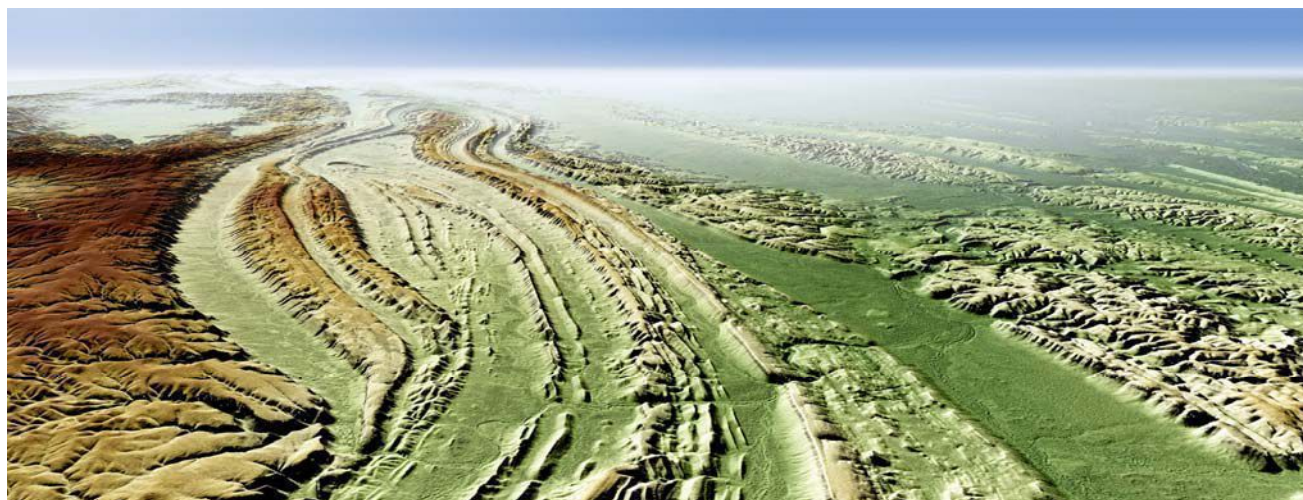
Fig. 3. – Digital Elevation Model (DEM) generated by TanDEM-X over the Finke Gorge National Park, close to Alice springs, Australia.

TanDEM-X has demonstrated the feasibility of an interferometric radar mission with close formation flight and delivers an important contribution for the concept and design of future SAR missions. One example is Tandem-L, a mission proposal for monitoring dynamic processes on the Earth surface with unprecedented accuracy [11], [12].