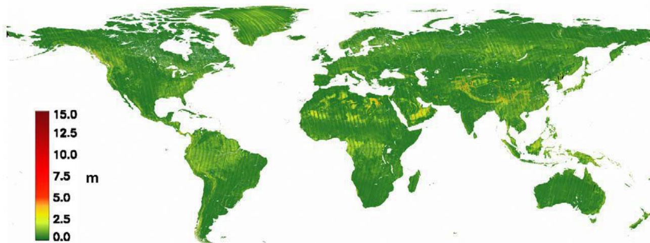
Fig. 2. – Predicted height accuracy of the TanDEM-X DEM derived from the interferometric coherence after the first and second global acquisition which were performed from December 2010 until March 2013. Subsequent data acquisitions until mid-2014 are not included in this prediction.

An orbit configuration based on a helix geometry has been selected for safe formation flying. The helix like relative movement of the satellites along the orbit is achieved by combination of an out-of-plane (horizontal) orbital displacement imposed by different ascending nodes with a radial (vertical) separation imposed by the combination of different eccentricities and arguments of perigee. Since the satellite orbits never cross, the satellites can be arbitrarily shifted along their orbits. This enables a safe spacecraft operation without the necessity for autonomous control. Cross- and along-track baselines ranging from 120 m to 10 km and from 0 to several 100 km, respectively, can be accurately adjusted depending on the measurement requirement [7].